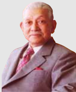
Founder Ryoichi Sasakawa