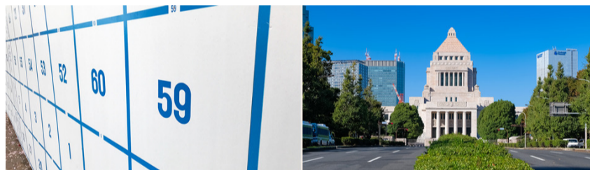
A signboard with designated spaces for each candidate's campaign poster (left); The National Diet Building in Tokyo, where both houses of the national legislature meet (right)

Ahead of the election, the 15th installment of The Nippon Foundation's Awareness Survey of 18-Year-Olds was carried out in late May and early June on the theme of "National Elections." The survey showed that of those respondents aged 18 and 19 (and therefore eligible to vote), roughly half plan to vote in the July election. Of those who plan to vote, roughly 60% said they will cast their vote based on the candidates' policies, while roughly 20% will vote based on political party. Additionally, of all respondents, more than 60% considered the voter turnouts of less than 55% for the previous two national elections to be "low." (We plan to post an English news release regarding the survey at a later date together with the results of the 16th installment, which is scheduled for release later this month.)