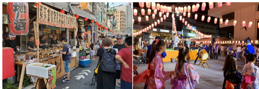
Scenes from neighborhood summer festivals in Tokyo: a stand selling 'yakitori' skewers of grilled chicken (left) and children dressed in yukata at a bon-odori festival (right)

At The Nippon Foundation, summer is a busy time with ocean-themed events, including cleanup activities to remove trash from beaches and in cities, recognizing that 80% of ocean debris is washed into the ocean from cities and towns on land. This summer also marks the beginning of the one-year countdown to the Tokyo 2020 Olympic and Paralympic Games. Among the events we are planning is the LOVE LOVE LOVE LOVE Exhibition featuring works of art that highlight diversity, to coincide with the Paralympics being held in Tokyo.