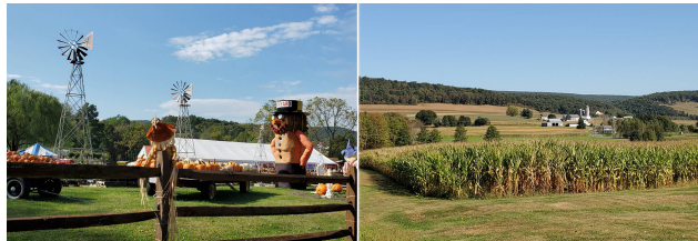
Pumpkins for sale (left) and a typical rural scene (right) in eastern Pennsylvania

Taking a break from the hustle and bustle of life in Tokyo, a member of the team that produces The Nippon Foundation News recently traveled to the United States to visit family and friends in eastern Pennsylvania. When people in Japan return from a vacation or business trip, they often bring sweets or snacks as souvenirs from their trip, called omiyage , to share with their friends and coworkers. In this month's newsletter we are including two photographs as omiyage from that trip for our readers.