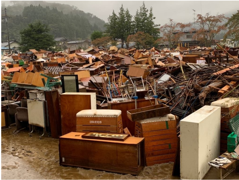
Many schools were damaged by flooding (Marumori Town, Miyagi Prefecture)