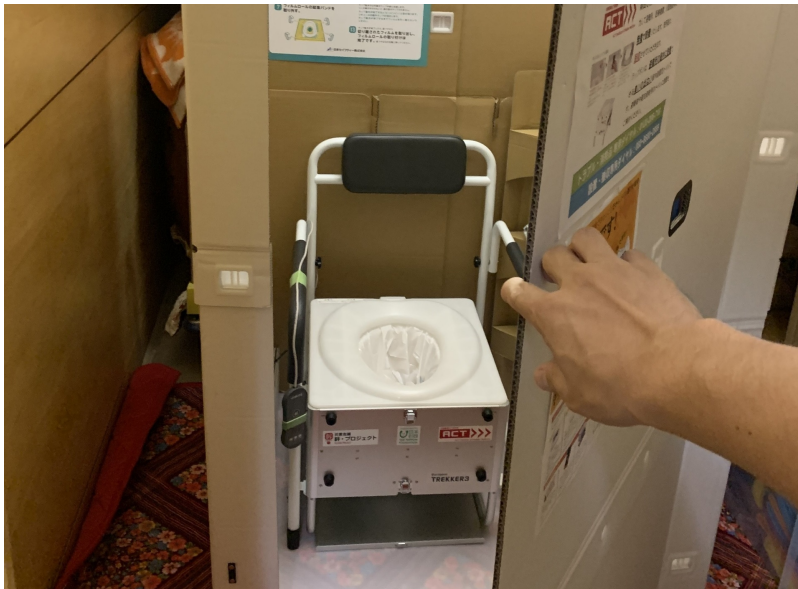
The Nippon Foundation has begun installing portable toilets in evacuation centers