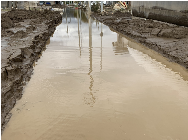
A road remains flooded more than a week after the typhoon (Nagano City, Nagano Prefecture)

Typhoon Hagibis, the season's 19th typhoon, passed through Japan on October 12-13. The typhoon, considered the strongest to strike Japan in decades, brought record rainfall and caused major damage across a wide area in the Tokai, Kanto, Koshinetsu, and Tohoku regions, taking the lives of more than 80 people. The Nippon Foundation is dispatching NGOs and volunteer organizations to the affected areas, and is collecting donations for these recovery activities. We ask for your support.