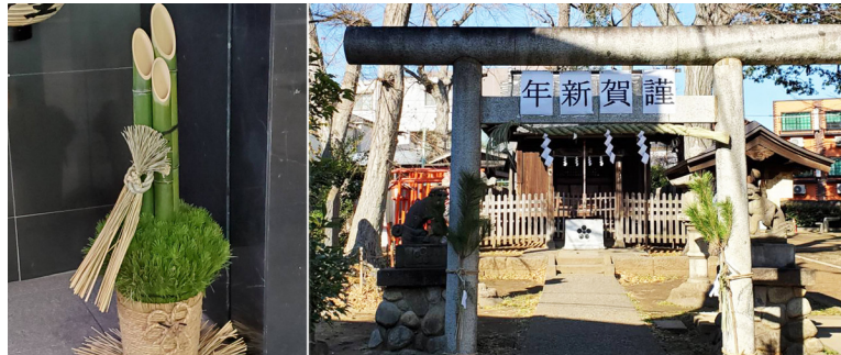
'Kadomatsu,' a traditional New Year's decoration made of pine and bamboo (left); The words 'Kinga Shinnen' (Happy New Year) at the entrance to a neighborhood Shinto shrine (right)

Happy New Year from The Nippon Foundation. The New Year's holiday is the most significant holiday of the year in Japan, with December 31 through January 3 as official public holidays and many companies adding additional days of vacation as well. Trains and planes are packed with people traveling overseas or returning to their family homes, meaning that the atmosphere in Tokyo is relatively quiet. Things have now returned to normal, and we are looking forward to the new year ahead.