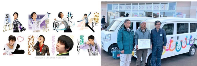
The set of Line stickers featuring Miyagi native Yuzuru Hanyu (left) and a vehicle supplied to The Nippon Foundation Disaster Recovery Support Center using a donation from the LINE SMILE+ PROJECT (right)

Establishment of The Nippon Foundation Disaster Recovery Support Center in Marumori Town (2020.01.17)