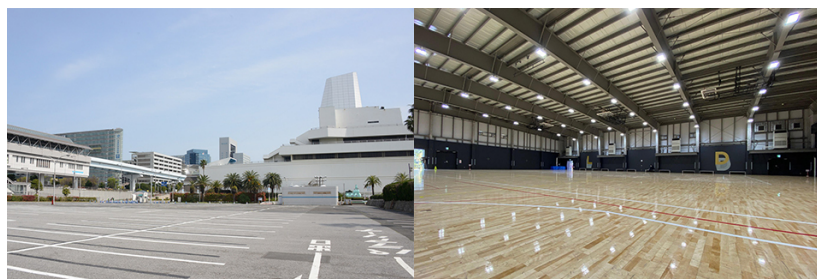
The parking lot where heavy-duty tents will be erected, with the Museum of Maritime Science in the background (left); The interior of The Nippon Foundation Para Arena (right)

<Request for Donations> Call for Emergency Support in Response to Spread of New Coronavirus (2020.04.07)