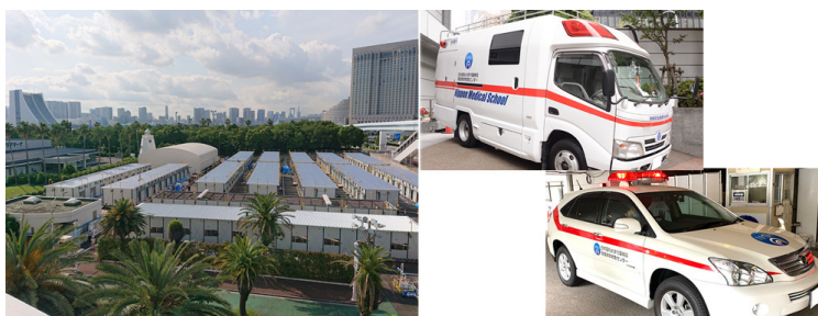
The Nippon Foundation Disaster Emergency Support Center as of June 2 (left); Two models of 'Doctor Cars' being donated to emergency medical institutions (center and right)

Request for Donations Call for Emergency Support in Response to Spread of New Coronavirus