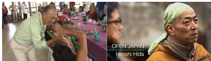
Screen shots of the YouTube videos introducing The Nippon Foundation's activities for the Elimination of Leprosy (left) and Support for Disaster Recovery (right)

The Nippon Foundation has also recently produced short YouTube videos introducing our activities in two of our priority areas – Support for Disaster Recovery and the Elimination of Leprosy. The videos are in Japanese with English subtitles, and can be viewed via the following links: