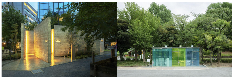
Newly built public toilets as part of THE TOKYO TOILET project (From The Nippon Foundation website;)

At The Nippon Foundation, last week three new public toilets in Tokyo parks were made available to the general public, the first of 17 to be built as part of THE TOKYO TOILET project. These facilities are being designed by leading architects and designers to be accessible and comfortable for anyone to use. Please see the article below for more information.