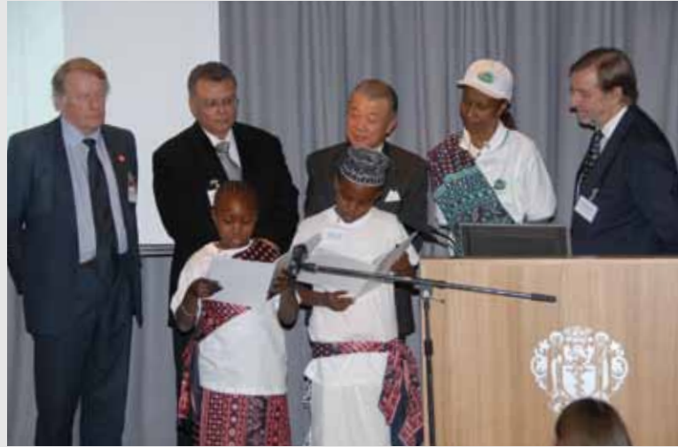
Affirming the right to live with dignity (London, 2008)