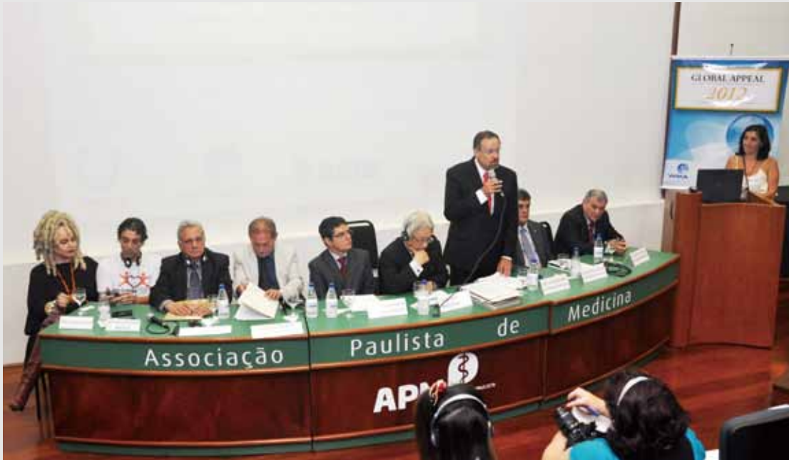
Drugs can cure leprosy, but only awareness can end stigma (Sao Paulo, 2012)