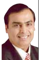
Mr. Mukesh D. Ambani Chairman & Managing Director Reliance Industries Ltd.