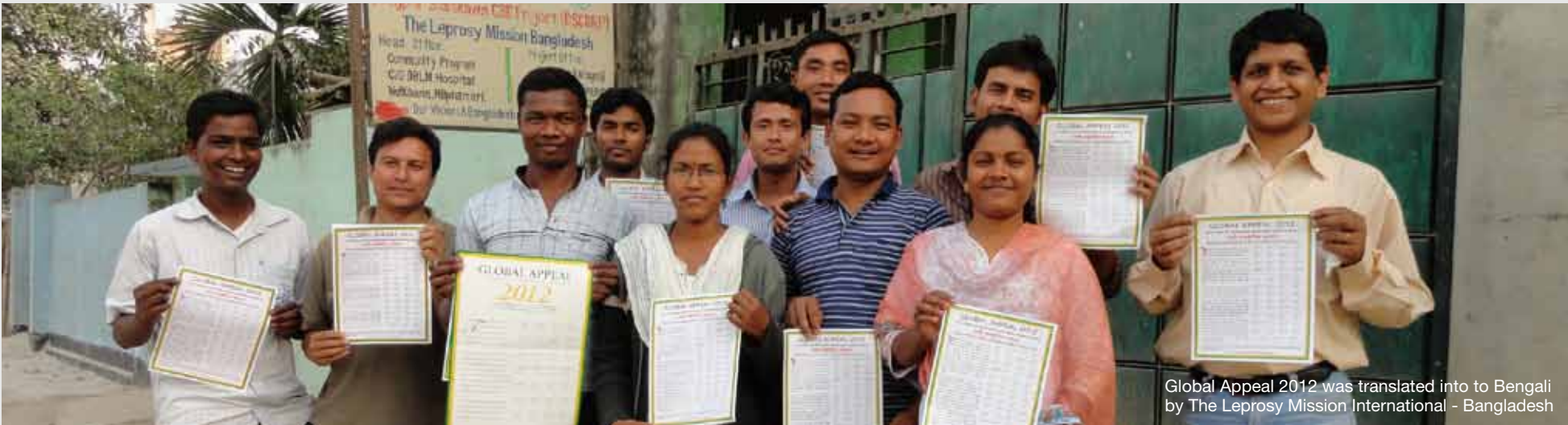
Global Appeal 2012 was translated into to Bengali by The Leprosy Mission International - Bangladesh

Leprosy has been one of the world’s most feared and misunderstood diseases. Today, thanks to modern chemotherapy, there is an effective cure. With early diagnosis and prompt treatment, it does not result in disability or disfigurement. A bacterial disease, leprosy is only mildly communicable. Some 16 million people have been treated and cured since the introduction of multidrug therapy (MDT) in the 1980s. Many myths and misperceptions about leprosy persist, however. While drugs can cure the disease, they cannot erase the social stigma and prejudice that come from a lack of public understanding. Discrimination against people affected by leprosy remains severe in some parts of the world. Denied the same opportunities for education, employment and marriage as other members of society, people affected by the disease find themselves marginalized. Their access to social services is limited or non-existent and their perfectly healthy children may be refused admission to school. Working to end this discrimination, Yohei Sasakawa, chairman of The Nippon Foundation,