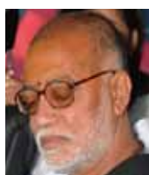
Sant Shri Morari Bapuji Shri Sitaram Seva Trust, India