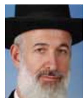
His Eminence Rabbi Yona Metzger The Chief Rabbi of Israel