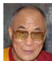
His Holiness The 14th Dalai Lama of Tibet