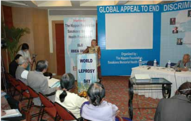
Launching the first Global Appeal (New Delhi, 2006)

Images from some of the fifteen Global Appeal launch ceremonies and related events that have been held between 2006 and 2020 in countries around the world.