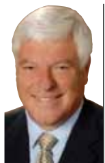
Mr. William C. Weldon Chairman & CEO Johnson & Johnson