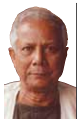
Prof. Muhammad Yunus Managing Director Grameen Bank