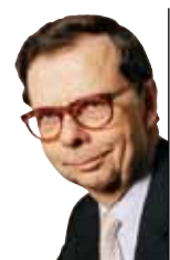
Mr. Louis Schweitzer Honorary Chairman and President Renault