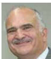
His Royal Highness Prince Hassan bin Talal of Jordan President Emeritus, World Conference of Religions for Peace