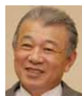
Yohei Sasakawa Chairman of The Nippon Foundation, Japan; WHO Goodwill Ambassador for Leprosy Elimination