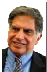
Mr. Ratan N. Tata Chairman Tata Group