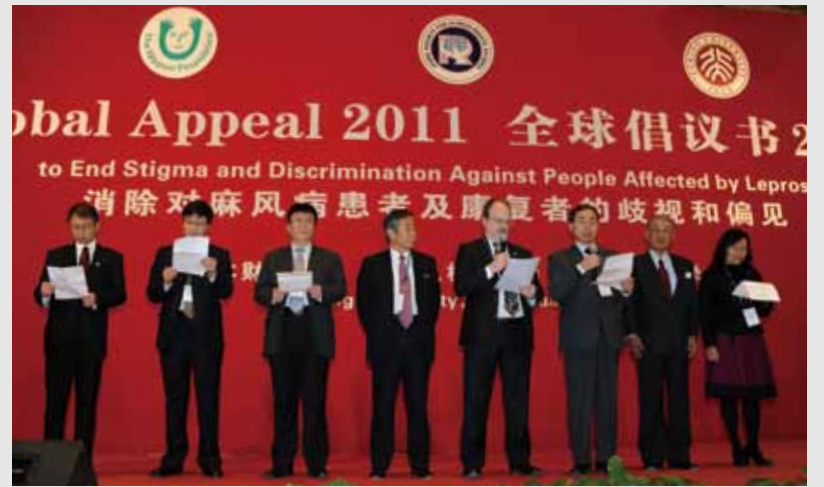
With awareness and education, stigma can be challenged (Beijing, 2011)