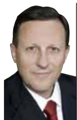
Dr. Daniel Vasella Chairman & CEO Novartis AG