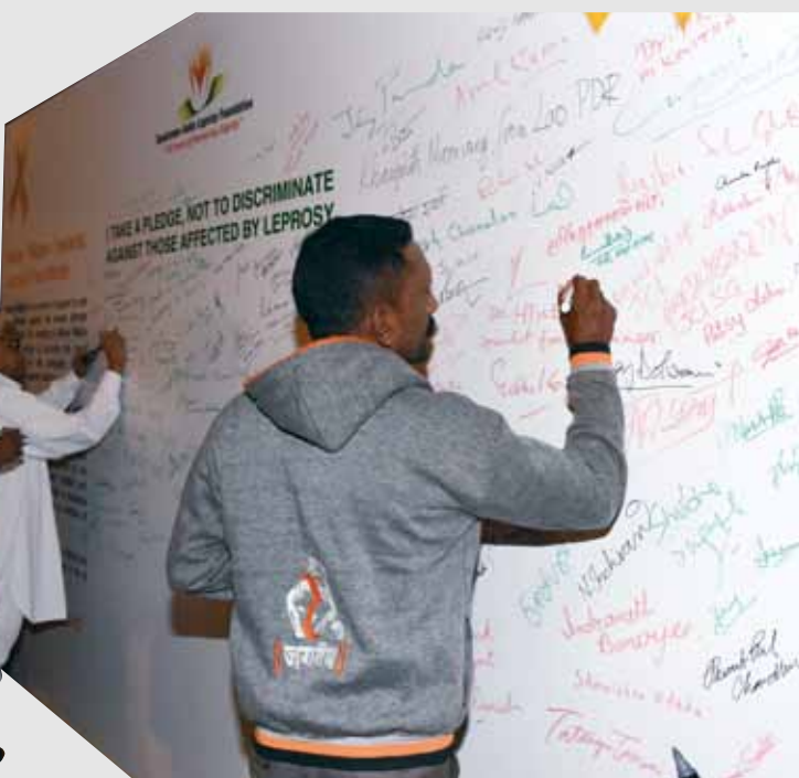
Pledges against discrimination (New Delhi, 2017)