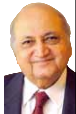
Mr. Keshub Mahindra Chairman Mahindra Group