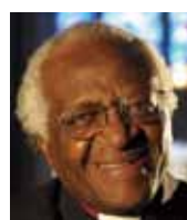
The Most Reverend Desmond Tutu Archbishop Emeritus of Cape Town, South Africa