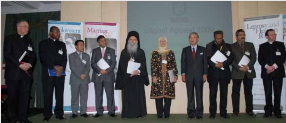
Faith leaders call for the healing to begin (London, 2009)