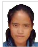
Lak Kiri Cambodia

"Every person is born free and equal in dignity and human rights." *