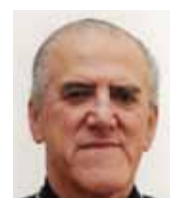
His Eminence Cardinal Javier Lozano Barragán President, Pontifical Council for Health Pastoral Care, Vatican