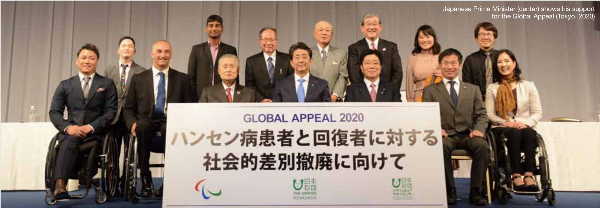
Japanese Prime Minister (center) shows his support for the Global Appeal (Tokyo, 2020)