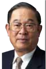
Mr. Fujio Cho Chairman Toyota Motor Corporation