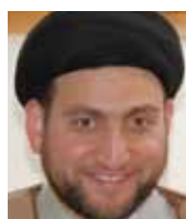
His Eminence Ammar A. Al-Hakim Vice President of Islamic Supreme Council of Iraq

Launched at Church House, London, on 26 January 2009, Global Appeal 2009 is an initiative of Yohei Sasakawa, Chairman of The Nippon Foundation.