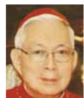
His Eminence Gaudencio Borbon Cardinal Rosales The Cardinal Archbishop of Manila, the Philippines