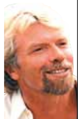
Sir Richard Branson Chairman Virgin Management Ltd.