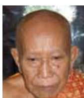
His Holiness Tep Vong The Great Buddhist Supreme Patriarch of the Kingdom of Cambodia