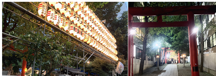
Lanterns at Hanazono Shrine in Tokyo for the Tori-no-Ichi festival on November 2 (left); The entrance to the shrine (right), which would normally be bustling with activity

Greetings from the Nippon Foundation. One of the highlights of November in Tokyo is the Tori-no-Ichi festival held at various shrines on the Days of the Rooster (which occur every 12 days) in the month of November under the Chinese zodiac calendar. Originally a harvest festival dating back to the mid-18th century, the festival has evolved into an event where merchants wish for good fortune in the coming year. A distinctive feature of the festivals is the sale of decorated bamboo rakes called kumade (bear's paw) to "rake in" good fortune. During the festival, the shrine grounds are usually lively and boisterous with crowds of people and stalls selling food and drink in addition to those selling kumade . This year, however, the events on November 2 were scaled back to prevent the spread of new coronavirus infections; while kumade were still being sold there were no food and drink stalls, and fewer people attending than in previous years.