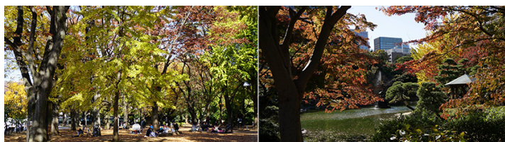
People enjoying the last of the warm weather under the trees in Ueno Park (left); Autumn leaves in Hibiya Park (right)

Greetings from The Nippon Foundation. With recent temperatures having suddenly turned colder, winter is arriving in Tokyo. The leaves on the trees have changed from green to a palette of reds, yellows, and oranges, and are now falling to the ground. Ueno Park, next to Ueno Station, Tokyo's gateway to the northeast, and Hibiya Park, adjacent to the Imperial Palace grounds in central Tokyo, are two of the city's oldest and largest parks. This year, the new coronavirus has meant that people are especially eager to spend their leisure time outdoors, but also close to home. With mostly sunny and relatively warm weather during much of November, Tokyo's parks have been ideal places to spend a weekend afternoon enjoying nature without having to travel.