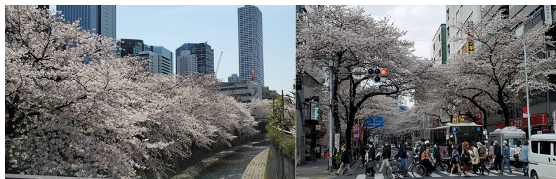
'Sakura' cherry trees in full bloom in Tokyo

Greetings from The Nippon Foundation. In Japan, April 1 is the beginning of the fiscal year for the government and most companies and other organizations, and also of the school year. This time last year, schools were closed and public gatherings were canceled to prevent the spread of coronavirus infections. Although the pandemic continues, it is now better understood and K-12 schools have mostly resumed in-person classes and events have resumed with social distancing and other preventive measures in place. This includes entrance ceremonies that have taken place across the country this week for students beginning their first year of elementary, junior high, and senior high school. Sakura cherry trees are usually in full bloom at this time, and are associated with these entrance ceremonies as a backdrop for photographs of a proud new student, often wearing a new school uniform, with his or her parents. The blossoming of the cherry trees is also a popular time for friends and coworkers to gather for hanami picnics under the trees, a ritual that for many people signals the beginning of spring. This year, however, hanami events have been canceled for the second year in a row because of the pandemic, so instead of eating and drinking under the trees, people enjoyed the blossoms while walking through parks and other scenic locations.