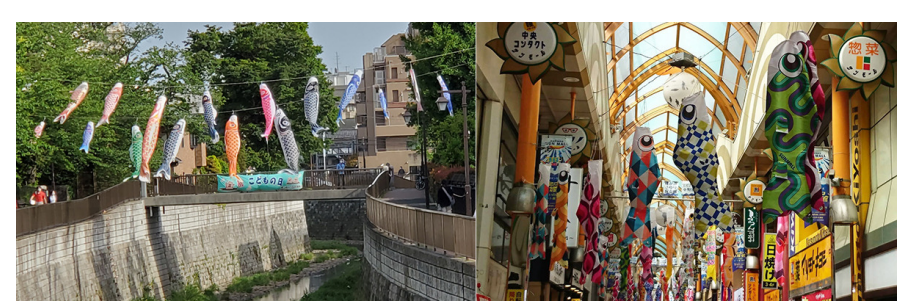
'Koinobori' streamers at an elementary school in 2021 (left); and a prepandemic display in a shopping arcade in 2019 (right)

Greetings from The Nippon Foundation. The week from April 29 to May 5 is known as Golden Week in Japan, with four national holidays falling during that period. This year, for the second year in a row, Tokyo and certain other areas were under a state of emergency because of an upward trend in coronavirus infections. Large department stores and entertainment facilities were closed, and sporting events were held without spectators. This year, the number of people going out or traveling was higher than last year, but still significantly lower than in normal years. The last of the Golden Week holidays is Children's Day on May 5, when families with young children wish for their children's happy and healthy growth. A popular Children's Day tradition is to fly carp streamers called koinobori , which appear to be swimming upstream – symbolizing courage and strength – as they fly in the wind. Elementary schools typically fly these streamers, and while many of these school activities were canceled last year, they resumed this year.