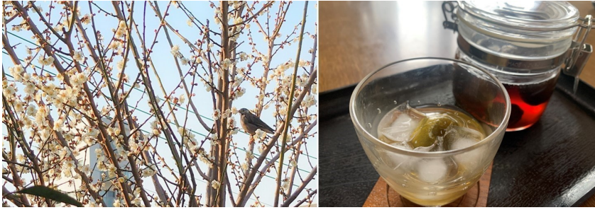
Early ume blossoms (left) and homemade ume syrup (right)

One of the signs that spring is approaching is the blooming of ume trees ( Prunus mume , commonly known as Chinese plum, Japanese plum, and Japanese apricot). Although not as well known outside Japan as the sakura cherry trees that will bloom a few weeks later, ume blossoms are a common theme in Japanese art, and viewing the blossoms is a popular seasonal activity. The ume fruit is also used in a variety of ways. Umeboshi are dried and preserved with salt, and eaten with rice or added to a glass of the distilled beverage shochu similar to the way lemons and limes are used in cocktails. Umeshu , also known as plum wine, is made by adding ume and sugar to a base liquor (usually shochu, but also sake, whiskey, or brandy) and aging. Leaving out the base liquor produces ume syrup, a non-alcoholic drink that can be enjoyed over ice, mixed with water or soda, or over shaved ice.