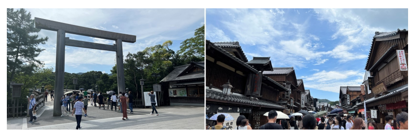
The 'torii' gate at the entrance to the Naiku from Uji Bridge (left), and tourists strolling through the town of Oharai-machi (right) during the Bon holiday

With most of the coronavirus-related restrictions that have been in place for the past two years being lifted, domestic tourism in Japan is gradually rebounding. On a visit to Ise during the Bon holiday in mid-August, we saw that many tourists had returned. In Oharai-machi, a town that developed next to the Naiku entrance as a place for pilgrims to relax after visiting the shrine, there were even lines of people waiting to eat at restaurants serving local delicacies.