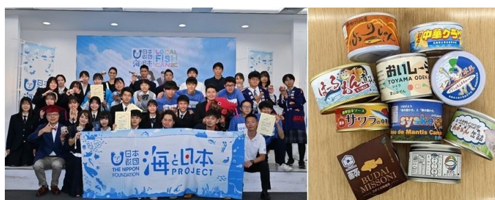
Group photo of participants at the LOCAL FISH CAN competition (left) and the products created for the competition (right)