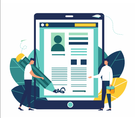
Case 8: Introduction of an electronic contract system

When the Working Group was established, TNF used paperbased contracts at the time. However, with paper-based contracts, the members with total blindness required to ask for support from others in checking the contract details and giving their signatures (i.e., proxy reading and signature assistance).