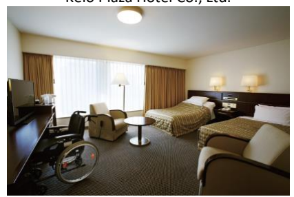
Keio Plaza Hotel Co., Ltd.

Accessibility improvements helped to increase sales. Beginning with the refurbishment of guest rooms to make them wheelchair-accessible, they improved the accessibility of the hotel's tangible and intangible elements. Their Universal Guestrooms were designed to be accessible to persons with physical, hearing, visual, and other disabilities, and included equipment such as handrails that can be adjusted or removed as necessary. These rooms are now also popular among older customers, and the occupancy rates of these rooms are on par with the hotel's regular guest rooms. Based on customer interviews, the flexible services the hotel offers are well received, and the hotel has increasingly been chosen as the venue for events of athletic organizations and ceremonies.