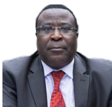
IPU Vice-President Mr. E. Ethuro (Kenya)