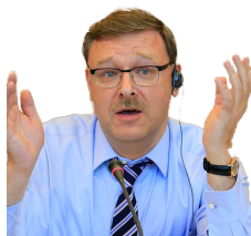
IPU Vice-President Mr. K. Kosachev (Russian Federation)