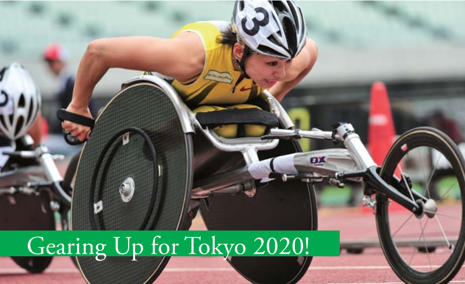
Gearing Up for Tokyo 2020!

from around the world, will strive to have a major worldwide impact by showcasing the abilities of disabled people in the realms of sports and art, while also presenting a wide range of opinions.