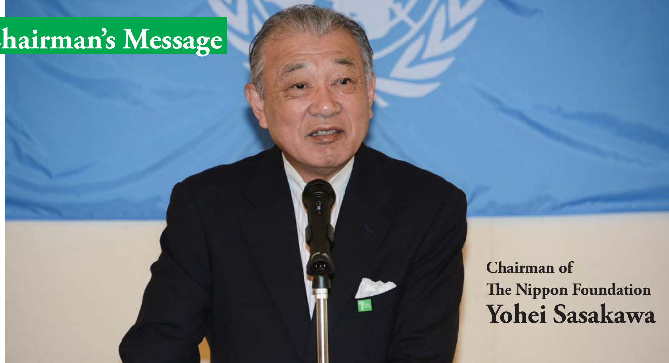
Chairman of The Nippon Foundation Yohei Sasakawa

The Nippon Foundation aims to realize an inclusive society and carries out various programs toward this end.