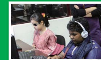
Utilizing ICT for Higher Education