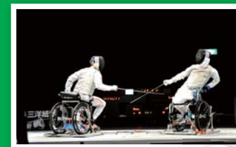
Discovering Hidden Talent