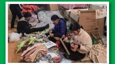
Supporting Financial Independence