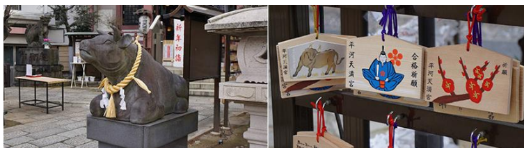
A statue of an ox (left), and 'ema' (right) hanging on a rack at Hirakawa Tenmangu. The center plaque shows a picture of Sugawara no Michizane with the inscription 'entrance exam success.'

Michizane was posthumously deified as Tenjin, the god of scholarship. Because of their association with scholarship, Tenman-gu shrines are also popular places for students to pray for success in entrance examinations, which in Japan are held from mid-January to early February. Ema are small wooden plaques sold at shrines, on which prayers or wishes can be written and may have a standard wish already printed on them. They are hung on a rack at the shrine and later burned in ritual ceremonies, so that the wishes can be received by the gods.