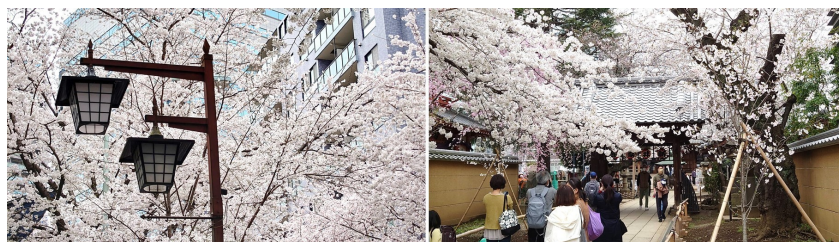
Sakura cherry trees in full bloom in Tokyo

Spring greetings from The Nippon Foundation. In Tokyo, the weather is getting warmer and the sakura cherry trees have fully bloomed and the blossoms have mostly fallen from the trees. Although coronavirus quasi-state of emergency measures that had been in place in 18 prefectures including Tokyo and Osaka ended on March 21, ad hoc measures continue to be taken on a situation-by-situation basis. This meant that for the third year in a row, large cherry blossom-viewing events were canceled, and popular parks limited the number of visitors and prohibited people from picnicking under the trees. People were still able to enjoy the blossoms, however, by going for walks in areas where trees were in bloom. With the daily number of new infections in Tokyo and other metropolitan areas lower than during the peak levels recorded in late January and early February but still relatively high, these types of measures appear set to continue for some time, as authorities attempt to strike a balance between preventing the spread of infections and restoring economic and social activity.