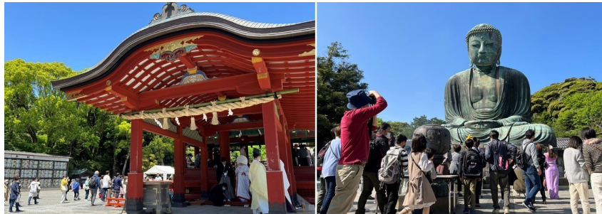
A wedding ceremony taking place with tourists in the background at Tsurugaoka Hachimangu shrine (left) and tourists visiting the Daibutsu (right) under a clear blue sky during Golden Week in 2022

One of these places is Kamakura, a city located by the Pacific Ocean less than an hour by train from central Tokyo. Kamakura was Japan's de facto capital from 1185 to 1333, and has many Shinto shrines and Buddhist temples. The Daibutsu (Great Buddha), an 11-meter-tall bronze statue of Amida Buddha on the grounds of Kotokuin temple, was built in the 13th century and today is the instantly recognizable symbol of Kamakura. Tsurugaoka Hachimangu, Kamakura's most important Shinto shrine, was built in 1063 and moved to its current site in 1180. The approach to the shrine begins at the waterfront and proceeds through the city center, ending with a large flight of stairs leading to the main building. Kamakura is also known for having many ajisai (hydrangea) on the grounds of several temples, which will be another tourist attraction when they bloom during the rainy season in June.