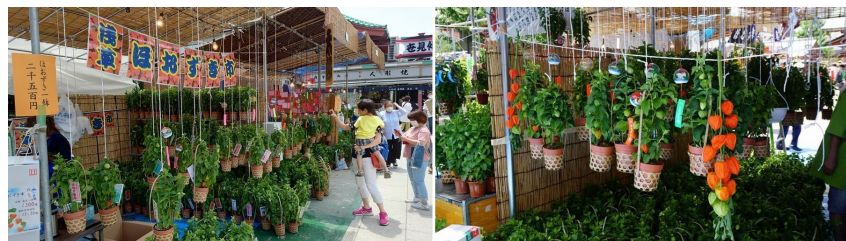
A stall selling hozuki plants at Asakusa's Sensoji temple (left) and potted hozuki plants with wind chimes for sale (right)

Another symbol of summer in Japan is the hozuki ( Physalis alkekengi ; Chinese lantern plant), an ornamental plant with flowers that resemble paper lanterns. Temporary markets selling the plants are a summer tradition, and the most famous in Tokyo takes place at Sensoji temple in Asakusa. Sensoji is one of Tokyo's oldest and most famous Buddhist temples, and the Hozuki-Ichi (Hozuki Market) there takes place every year on July 9 and 10. Many stalls are set up with vendors selling potted hozuki plants as well as flowers and clipped branches. There is also a belief that prayers offered at Sensoji on July 10 will bring 46,000 days of blessings, making this a popular time to visit the temple.