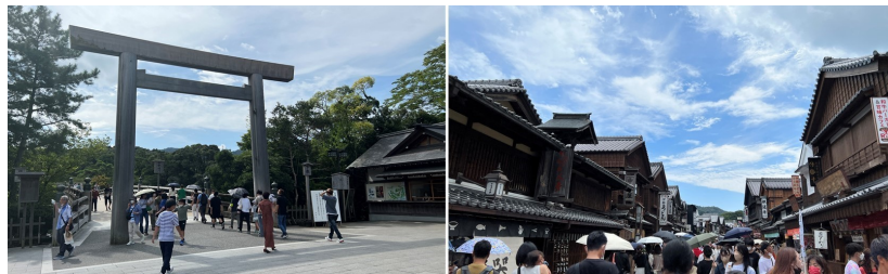
The 'torii' gate at the entrance to the Naiku from Uji Bridge (left), and tourists strolling through the town of Oharai-machi (right) during the Bon holiday

With most of the coronavirus-related restrictions that have been in place for the past two years being lifted, domestic tourism in Japan is gradually rebounding. On a visit to Ise during the Bon holiday in mid-August, we saw that many tourists had returned. In Oharai-machi, a town that developed next to the Naiku entrance as a place for pilgrims to relax after visiting the shrine, there were even lines of people waiting to eat at restaurants serving local delicacies.