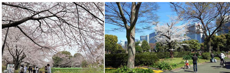
People enjoying sakura in Soshigaya Park in Tokyo’s western suburbs (left) and in Hibiya Park next to the Imperial Palace in central Tokyo (right)

Greetings from The Nippon Foundation. Sakura (Japanese cherry trees) are a well-known symbol of Japan, and hanami picnics under the trees when they are in bloom are a popular way of celebrating the arrival of spring. In much of the country the trees bloom in late March or early April, and the blossoms are only on the trees for about two weeks. The trees start to bloom on the southwest island of Kyushu, and the “front” of blooming trees moves northeast across the country, eventually reaching the northern island of Hokkaido in mid to late April. The front’s progress is included as part of television news programs’ weather forecast, and is closely followed as people plan their hanami events. March 31 is also the end of both the academic year and the fiscal year for the government and many companies in Japan, so hanami season coincides with graduation ceremonies and parties to welcome and say farewell to new and departing work colleagues. Coronavirus-related restrictions have meant that most hanami events were canceled during the past three years, and this year was the first time in four years hanami could be enjoyed without restrictions. Unfortunately, however, this year Tokyo had rainy weather during the last weekend in March, when the trees were in full bloom.