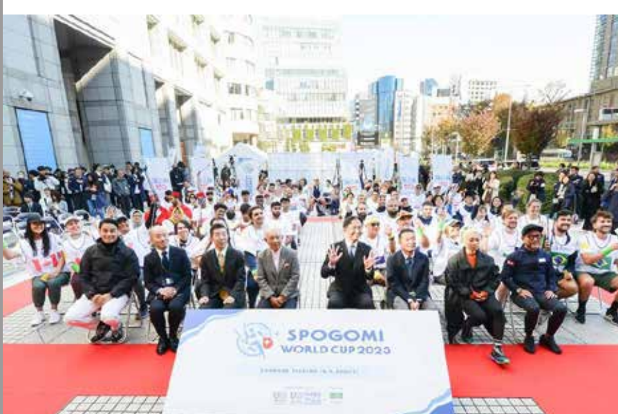
Group photo of 21 national champion teams, hosts, and ambassadors

British Team Wins First SPOGOMI World Cup. (2023.11.24)