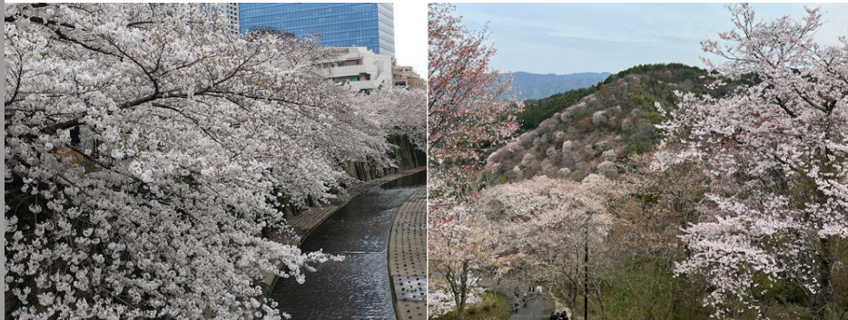
Sakura cherry trees in bloom along the Kanda River in Tokyo (left) and on Mount Yoshino near the ancient capital of Nara (right)

Greetings from The Nippon Foundation. April is the start of the school year in Japan, as well as the beginning of the fiscal year for the government and many companies, making this a time of new beginnings for many people. Mid-March through mid-April is also when sakura cherry trees bloom across much of Japan, and many people welcome the arrival of spring with hanami cherry-blossom-viewing parties under the trees' white flowers. This year was also the first time that people have been able to gather for hanami parties since Japan's downgrading of the coronavirus and lifting of its last restrictions to prevent the spread of infections in May 2023. In the Tokyo area, the weather was cool and cloudy when the trees were in full bloom this year, but popular parks still saw many groups of friends, families, students, and coworkers enjoying themselves under the blooming trees.